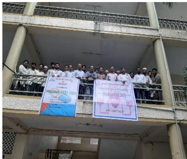
Blood Donation Camp 2019-2020