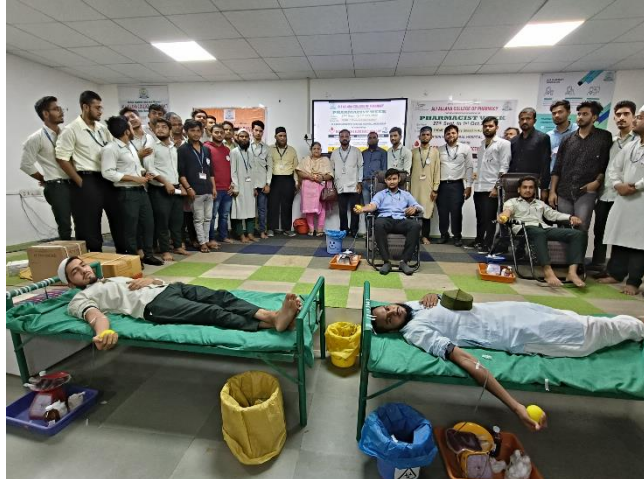
Blood Donation Camp 2022-2023